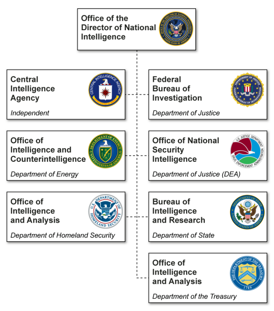
Figure 1: Civilian IC Elements and Their Respective Departments

Program. <sup>10</sup> The IC comprises 17 different organizations, or IC elements, across the federal government represented by 6 executive departments. These IC elements include ODNI, seven other civilian IC elements, and nine military IC elements. The eight civilian IC elements within the scope of our review include two intelligence agencies and six intelligence components within five departments (see fig. 1). <sup>11</sup> For the purposes of this review, we are referring to the eight as the civilian IC elements. Appendix III provides additional information on each of the eight civilian IC elements' missions.