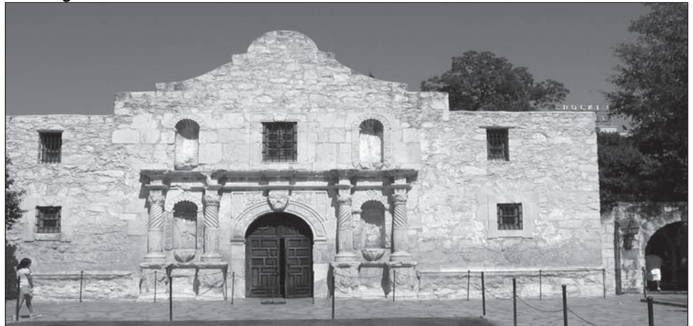
National Historic Landmark Address (The Alamo) Used by GAO as Principal Office Location for a Bogus HUBZone Firm

The HUBZone program remains vulnerable to fraud and abuse. Using falsified documents and employee information, GAO obtained HUBZone certification for three bogus firms using the addresses of the Alamo in Texas, a public storage facility in Florida, and a city hall in Texas as principal office locations. A simple Internet search by SBA could have revealed these as phony applications. While the agency has required more documentation in its application process since GAO's July 2008 report, GAO's testing shows that SBA does not adequately authenticate self-reported information and, for these cases, did not perform site visits to validate the addresses. Further, the changes have significantly increased the time it takes SBA to process applications. Specifically, SBA took 7 or more months to process each of the bogus applications—at least 6 months longer than for GAO's previous investigations. SBA continually lost documentation for GAO's fourth application, and eventually withdrew it after GAO failed to resubmit the same materials for the fourth time. On its Web site, SBA reported that applicants are experiencing delays during the application process.