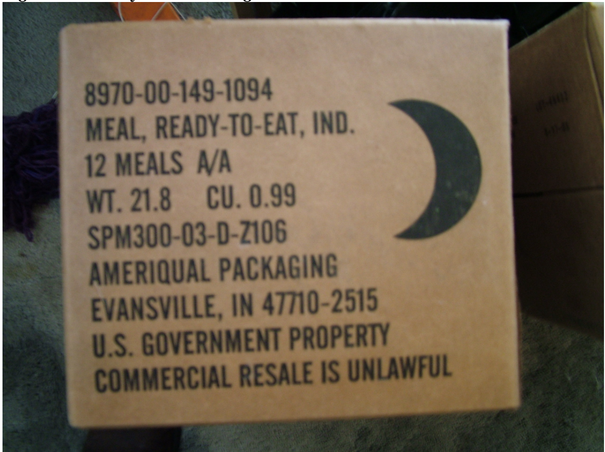
Figure 1: Military MRE Labeling