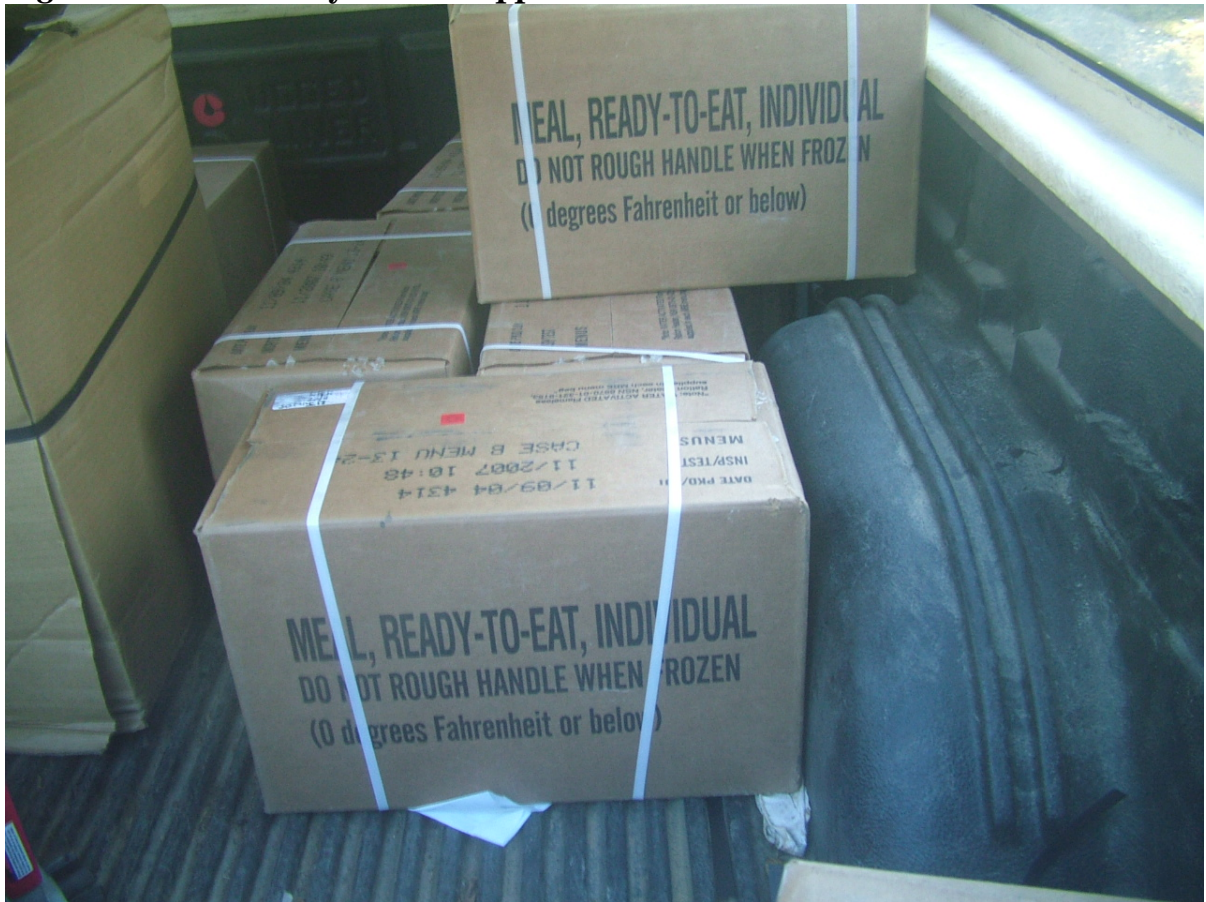
Figure 2: MREs Ready to Be Shipped