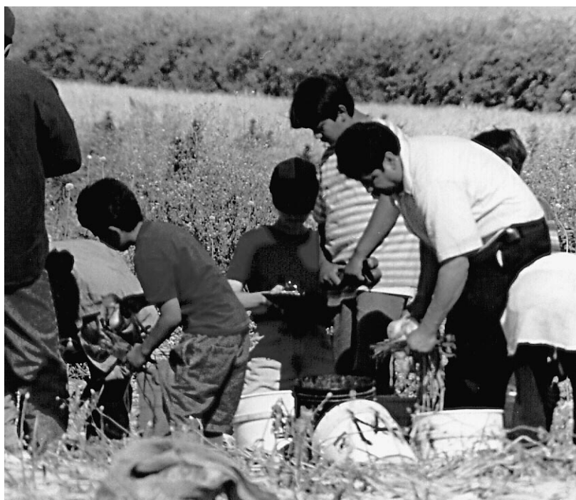
Figure 1: Children as Young as 6 Picking Onions, April 1998