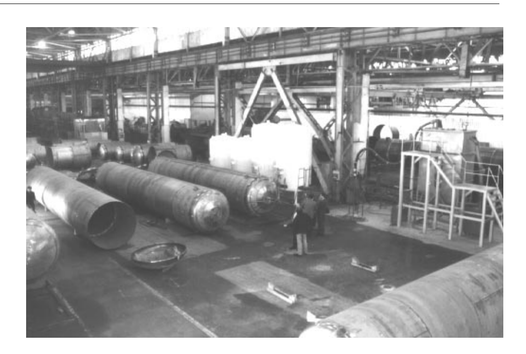
Figure I.2: Cryogenic Pressure Vessel Production at a Former Missile Production Facility