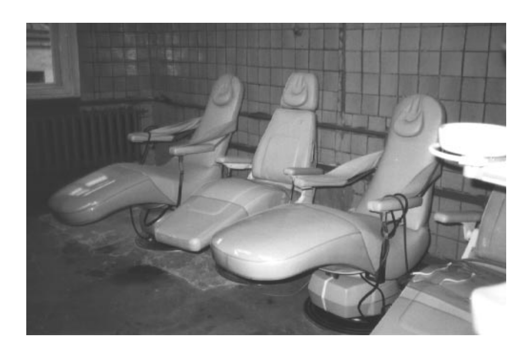
Figure I.6: Dental Chair Production Line at a Former Manufacturer of Portable Naval Radiation Decontaminators