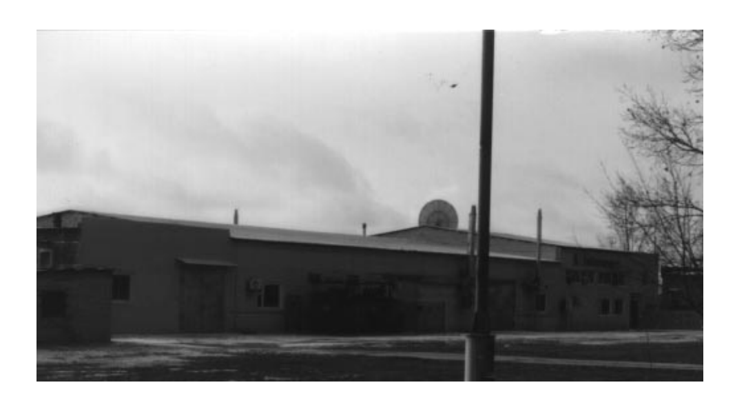
Figure I.3: Building Originally Constructed for a Soviet Defense Conversion Project That Now Houses a U.S.-Kazakstan Printed Circuit Board Production Line