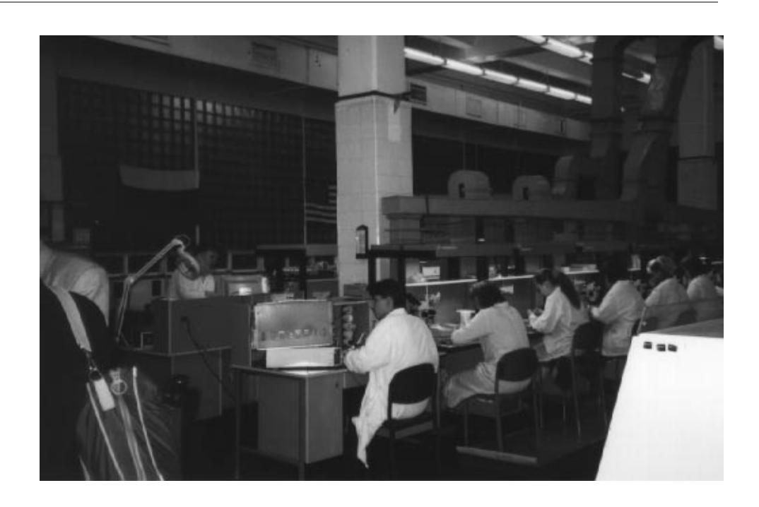
Figure I.5: Hearing Aid Production at a Former Integrated Circuit Production Building

• Status of project : Istok is now planning to produce another hearing aid and focus attention on selling it on the export market (mostly in third world countries) as well as on the Russian market. Istok also hopes to begin production on a hearing aid aimed at severely hearing impaired individuals. The joint venture has asked DSWA to provide additional funding to help move the venture forward.