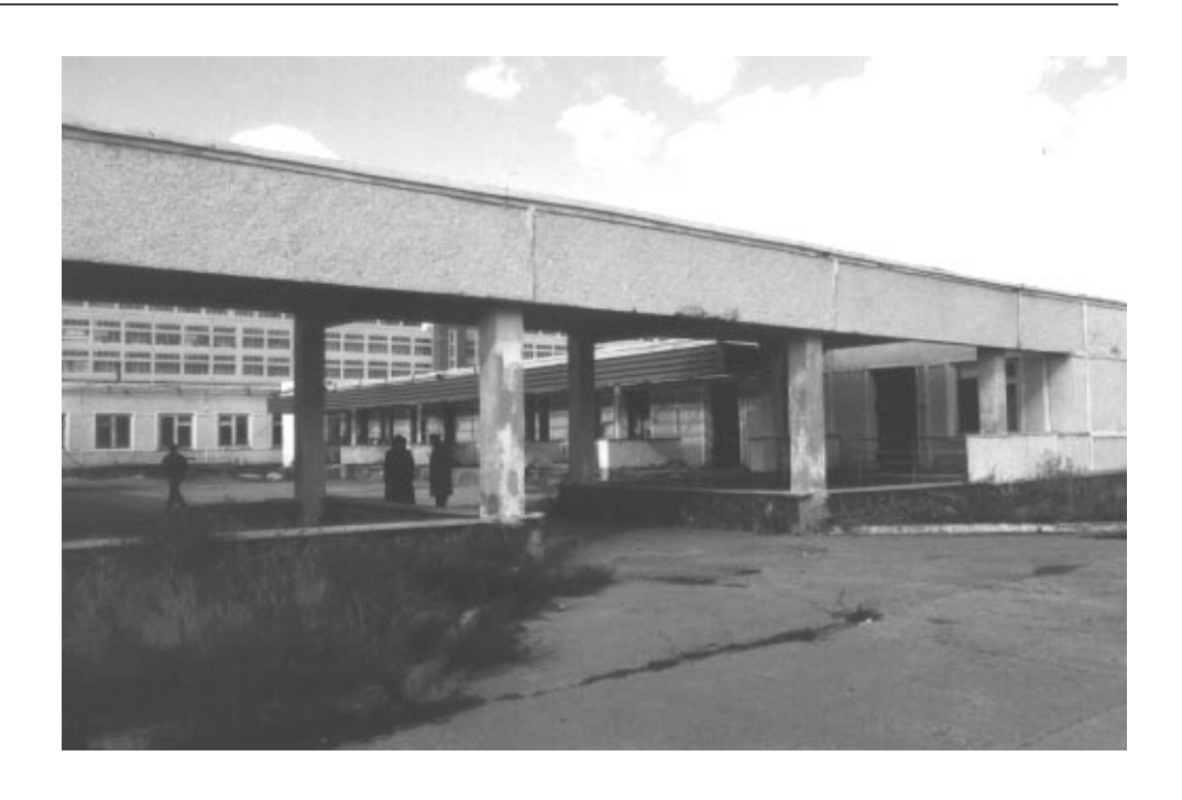
Figure I.1: Abandoned Infirmary at a Biological Weapons Factory Where Construction of a Pharmaceutical Production Line Has Begun