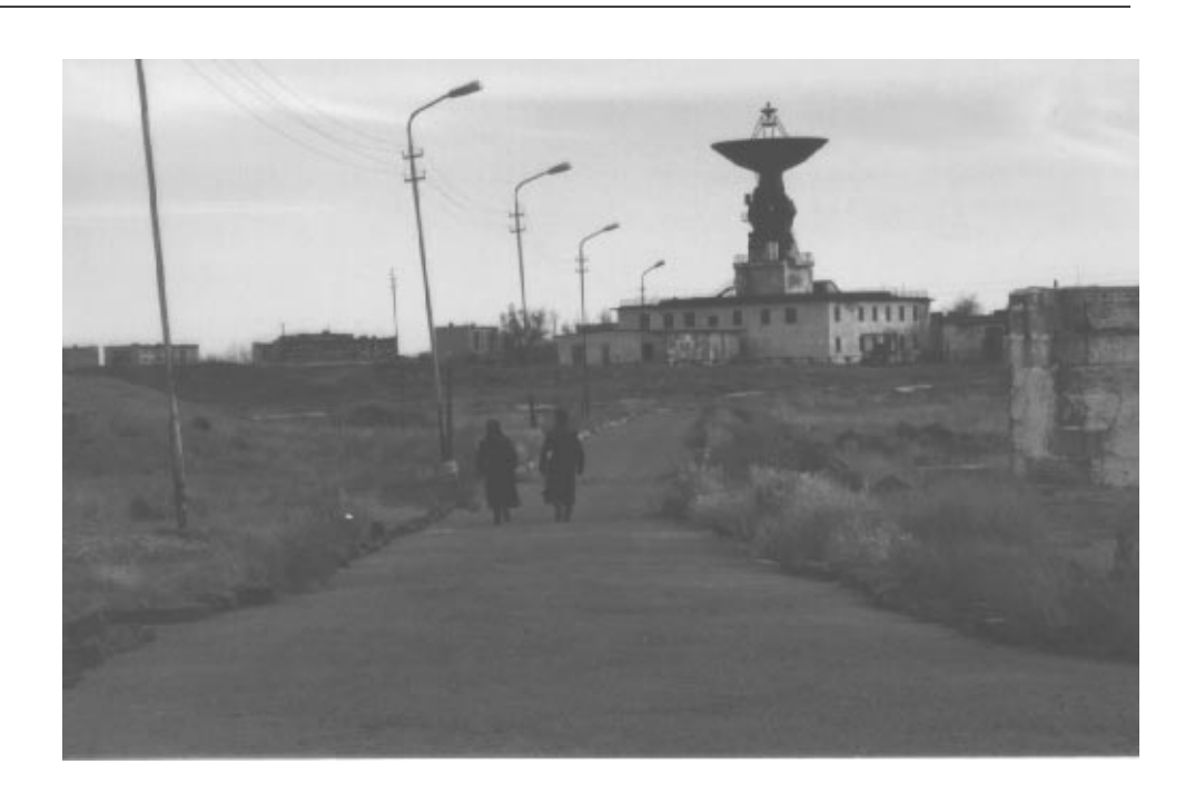
Figure I.4: Abandoned Soviet Command and Control Base Where One Project Occupies a Building