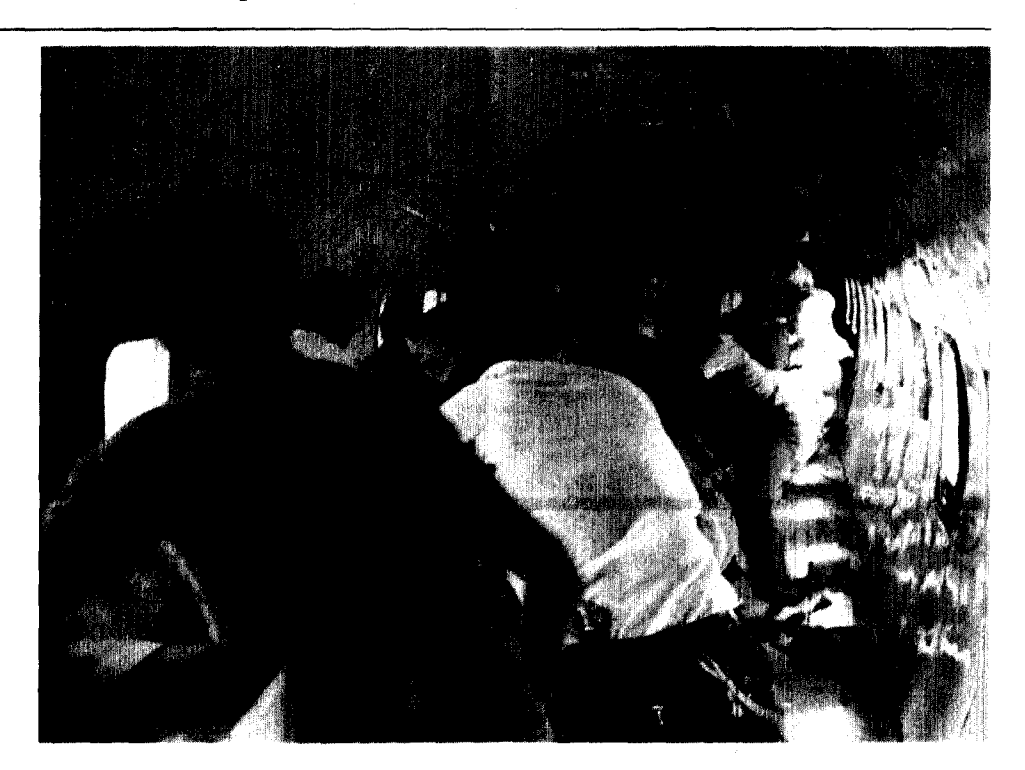
Figure 3.3: Air Cargo Handlers Preparing for an Airdrop

The DC-6 crashed into the side of a mountain on February 25, 1989, and all 10 persons aboard were killed. The exact cause of the crash could not be determined, but AID officials believe that the plane ran out of fuel. To compensate for the loss, AID increased the use of the helicopters to deliver supplies previously air-dropped. Local trucking firms delivered supplies to central Honduras where the Resistance loaded the helicopters with supplies to be transported to eastern Honduras. According to AID and Air Logistics officials, this method worked well but placed significant demands on the helicopters and the pilots. To meet the increased work load, the helicopter company hired a third pilot in June 1989. In July 1989, AID contracted with another air cargo company to provide fixed wing aircraft to resume the airdrops.