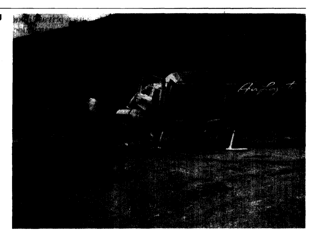
Figure 3.4: Resistance Members Loading an AID Contractor's Helicopter