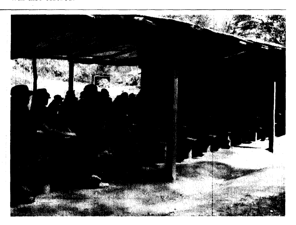
Figure 3.2: Resistance Members Attending Human Rights Training

In January 1989, AID awarded a grant to the Resistance to provide human rights training to Resistance members through April 1989. AID obligated about $178,000 in second-phase funds for this grant. AID subsequently extended the grant through March 1990 and obligated $170,000 in third-phase funds for the extension. The Resistance hired civilians and some of its members to provide instruction on the Resistance military code of conduct and system of military justice. According to the Resistance official directing this training program, about 4,000 Resistance members in Honduras had been trained as of April 1989.