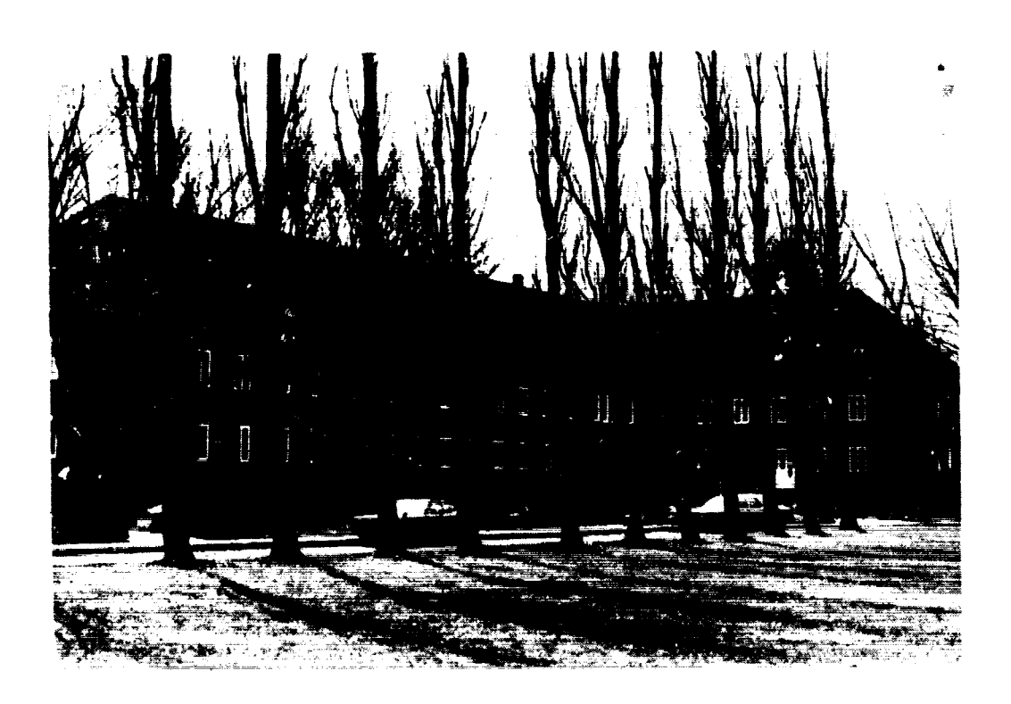
Community officials stated that this administrative building above was only about 25-percent utilized.