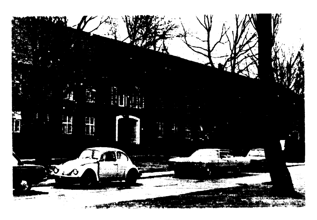
The building above was also used for administrative functions. An official estimated that less than 50 percent of its space was used.