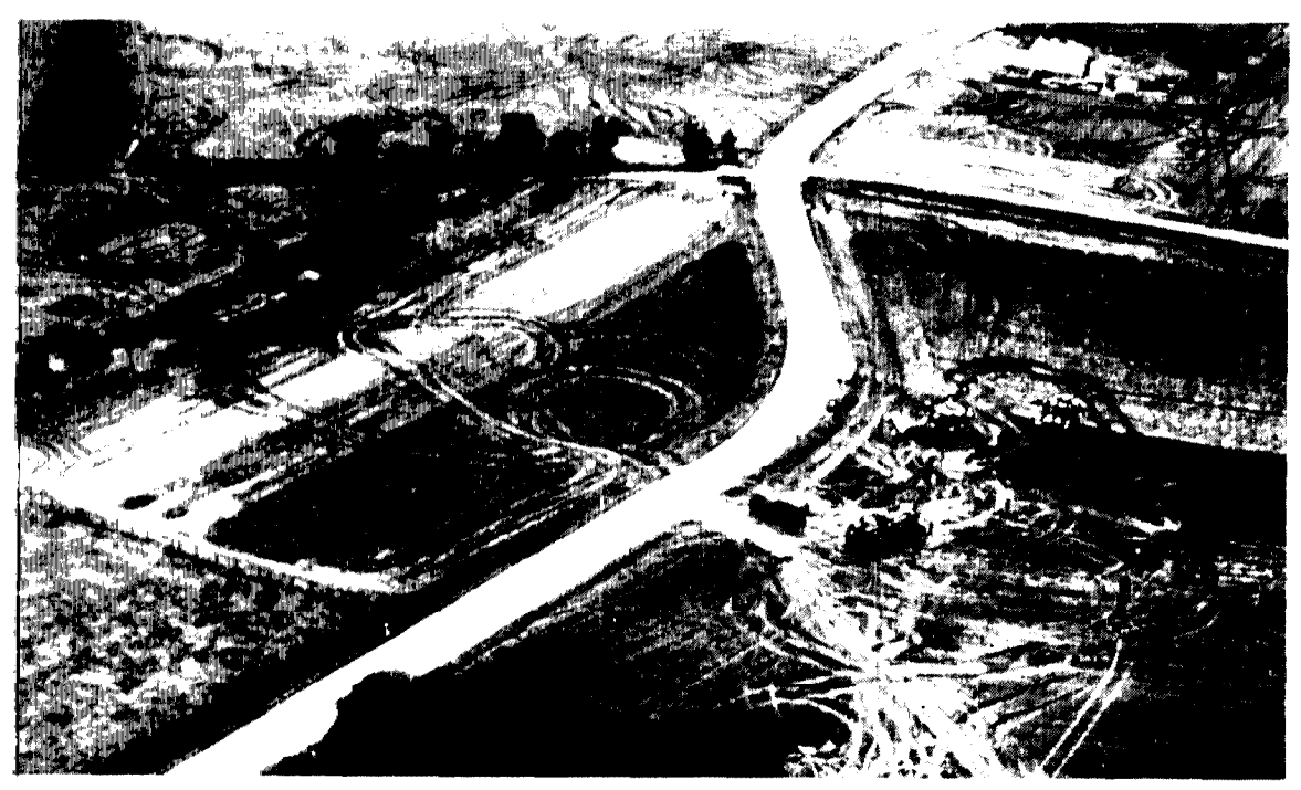
THE DAMAGE TO THESE FIELDS, USED AS A STAGING AREA FOR TANKS AND OTHER HEAVY ARMORED VEHICLES, WILL RESULT IN SEVERAL CLAIMS. THE COUNTRY ROAD IS PROBABLY ALSO DAMAGED WHERE THE VEHICLES ENTER AND LEAVE THE FIELDS.