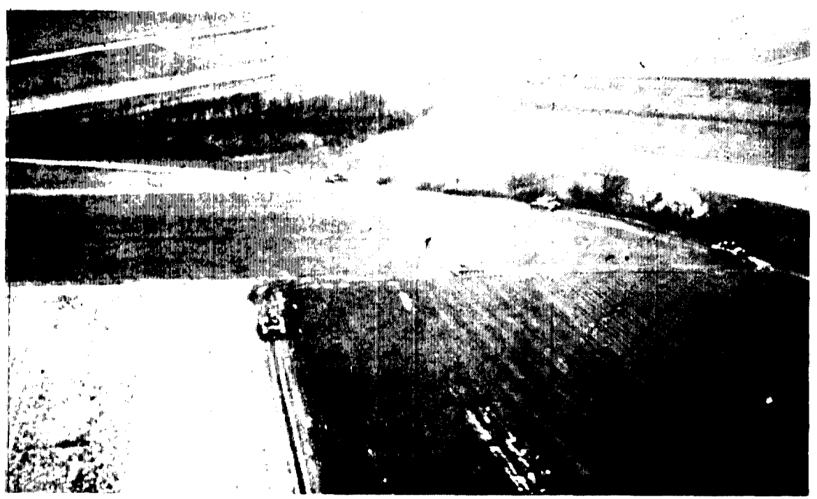
THE TANK COLUMN MOVING THROUGH THESE FIELDS IS CAUSING A MINIMUM AMOUNT OF DAMAGE AND LEAVING FEW TELL-TALE TRACKS VISIBLE FROM THE AIR. IN A REAL COMBAT SITUATION, HOWEVER, THE TANK COMMANDER MAY PREFER TAKING A STRAIGHT PATH TO CUT HIS TRAVEL TIME.

in the property of the control of the control