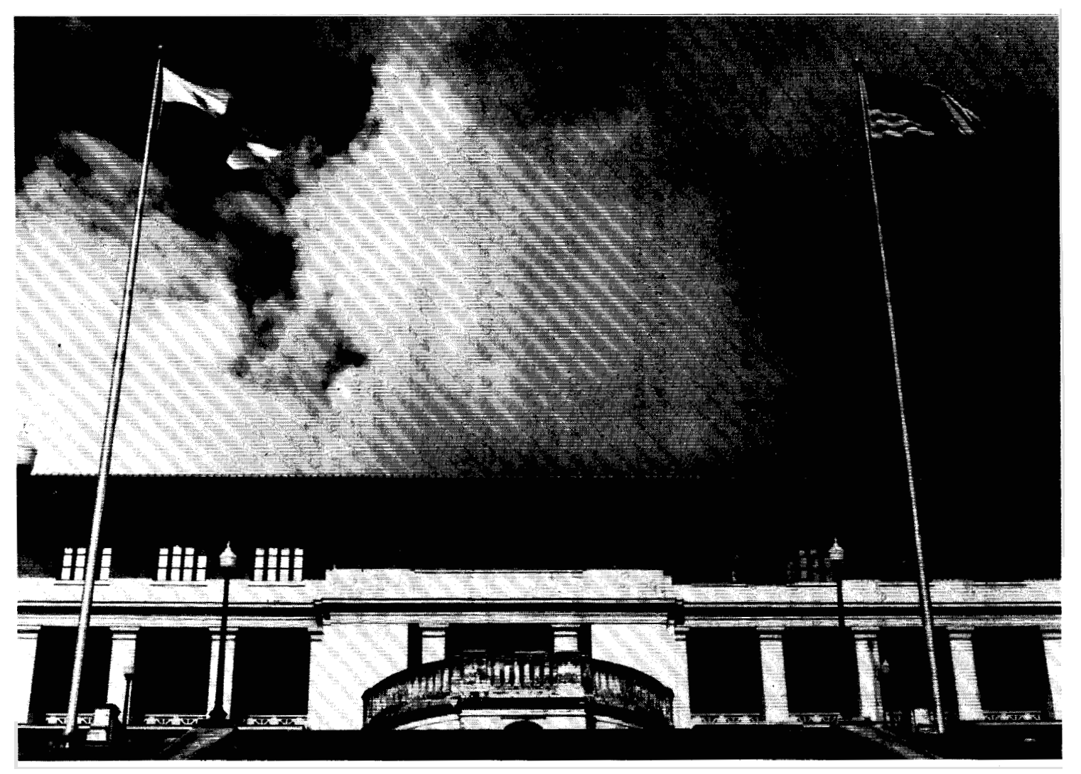
THE FLAGS OF PANAMA AND THE UNITED STATES FLY SIDE BY SIDE AT THE PANAMA CANAL COMMISSION'S HEADQUARTERS.