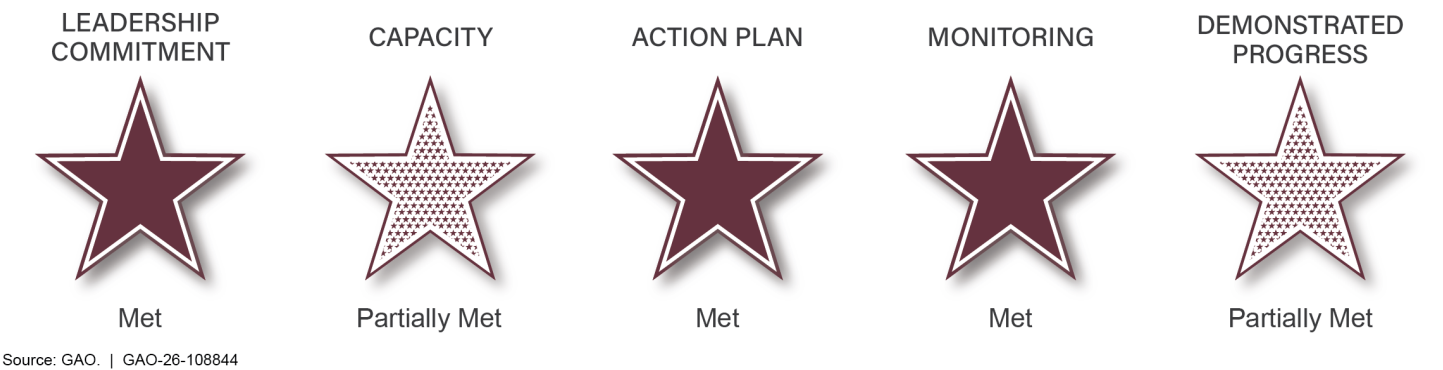
Figure 2: Department of Veterans Affairs (VA) Progress on Addressing Criteria for Removing VA Disability Benefit Eligibility Criteria Update from GAO’s High-Risk List

While VA has made progress in addressing this high-risk area, much work remains to be done. Specifically, VA has not fully defined the resources needed for, nor has VA demonstrated adequate progress in, updating its medical and earnings loss information. To fully meet all five criteria for removal from this high-risk area, VA needs to continue building capacity and demonstrating progress. VA has continued to face delays in fully completing its comprehensive update of the rating schedule. VA extended the timeline to complete its first round of comprehensive updates to fiscal year 2026—10 years beyond VA’s initial goal. According to VA officials, four of the 15 body systems have yet to be updated: mental disorders, respiratory, auditory, and neurological conditions. 15 The mental disorders and neurological body systems contain conditions such as PTSD and traumatic brain injury (TBI), respectively, which are “signature wounds” of the conflicts in Afghanistan and Iraq, according to the Department of Defense. Moreover, PTSD is among the