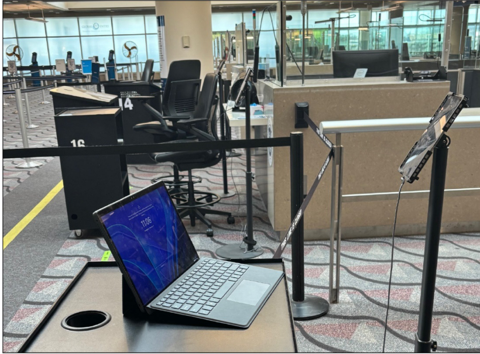
Figure 3: Tablets for Enhanced Passenger Screening Procured Through U.S. Customs and Border Protection (CBP) Donation Acceptance Program, Minneapolis-St. Paul International Airport

Source: U.S. Customs and Border Protection photo. | GAO-26-108751