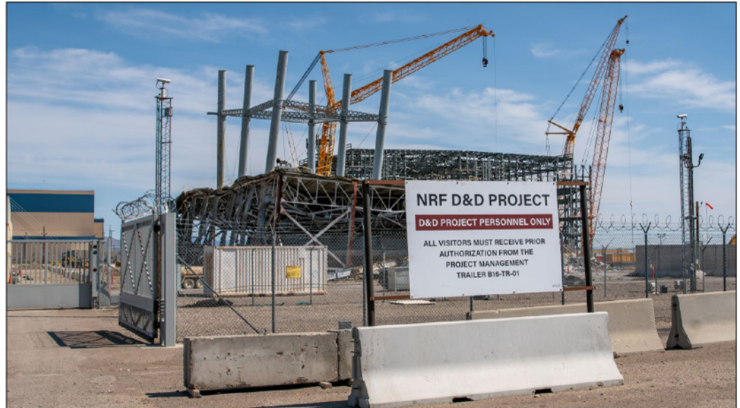
Figure 3: DOE Office of Naval Reactors Decontamination and Decommissioning Project Site in Idaho Under Operational Control of DOE's Office of Environmental Management

Source: Department of Energy (DOE). | GAO-26-108056