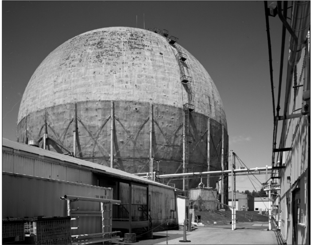
Figure 6: Hortonsphere Located at DOE Office of Naval Reactors' Kenneth A. Kesselring Site in New York

Source: Department of Energy (DOE) and Bruce G. Harvey. | GAO-26-108056