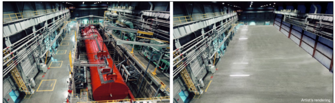
Figure 5: DOE Office of Naval Reactors Decontamination and Decommissioning Plan for a Facility in Idaho That Houses a Nuclear Propulsion Prototype, Before (Photo) and After (Artist Rendering)

GAO-26-108056