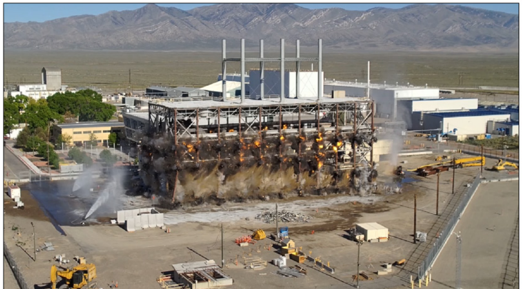
Figure 1: Demolition of the Submarine First Generation Westinghouse (S1W) Nuclear Propulsion Prototype Facility at a DOE Office of Naval Reactors Site in Idaho

GAO-26-108056