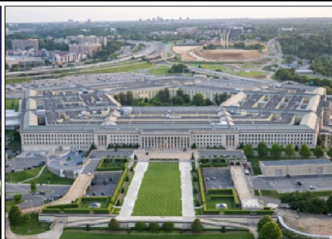
The Pentagon, Virginia

GAO-26-107818