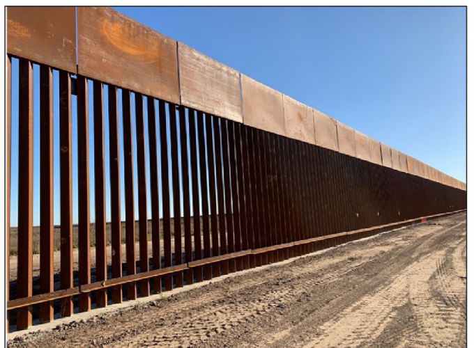
Figure 1: Border Barrier Featuring Steel Bollards in Starr County, Texas (Left), and Border Barrier and Enforcement Zone under Construction in South Texas (Right)

level. CBP uses supporting attributes such as technology (e.g., surveillance cameras), lighting, and roads for maintenance and patrolling to establish varying enforcement zones as part of the barrier system. Figure 1 shows an example of bollard panels and barrier construction in south Texas, constructed atop levee walls, and a 150-foot wide border enforcement zone on the river side of the barrier.