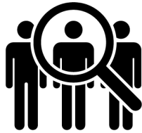
Figure 2: Coast Guard Implementation of Selected Recruitment and Retention Leading Practices for Its Cyberspace Workforce, as of September 2022