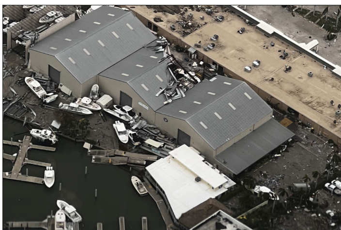
Coast Guard flights over parts of western Florida to locate survivors and assess damage after Hurricane Ian.

GAO-23-106409