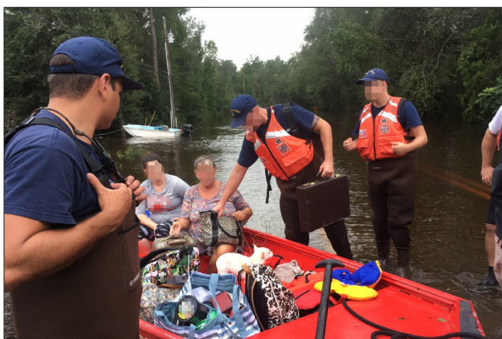
Coast Guard rescue operations in Jacksonville, Florida after Hurricane Irma.