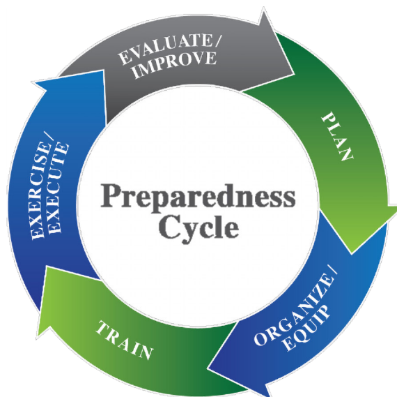
Figure 3: U.S. Coast Guard Preparedness Cycle

Source: U.S. Coast Guard. | GAO-23-106409