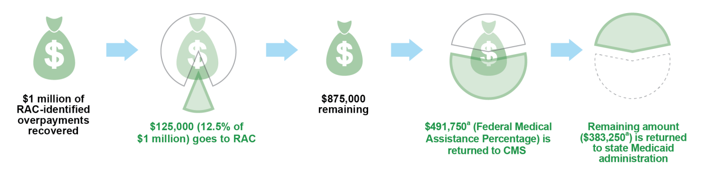
Figure 1: Example of Recovery Audit Contractor (RAC) Payment Flow for Contingent Fee-Based Audits

Source: GAO analysis of Centers for Medicare & Medicaid Services information. GAO. (icons) | GAO 23-106025