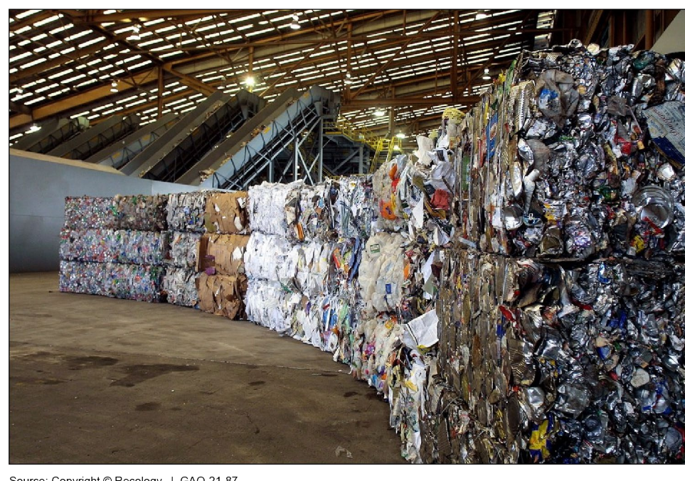
Figure 1: Bales of Sorted Recyclable Plastic, Paper, and Metal

Source: Copyright @ Recology. | GAO-21-87