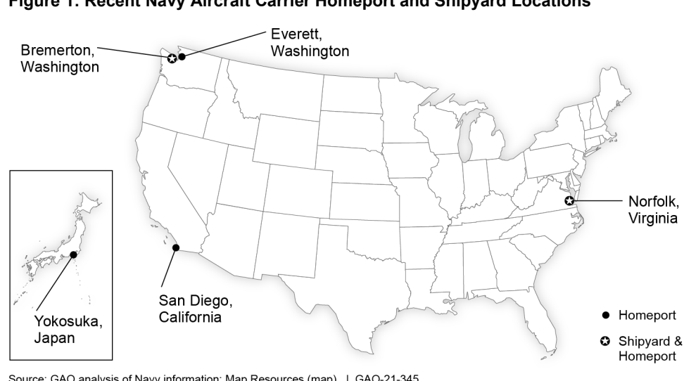
Figure 1: Recent Navy Aircraft Carrier Homeport and Shipyard Locations

GAO-21-345