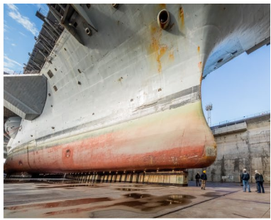
Source: GAO analysis of Navy information; Map Resources (map); U.S. Navy/T. Nguyen (photo). | GAO-21-345

The Navy made 15 aircraft carrier homeport changes in fiscal years 2011 through 2020 among the five available homeports. The driving factor for all 15 changes was maintenance. For example, 10 of the 15 changes involved ships moving to or returning from shipyards in Bremerton or Norfolk for planned dry-dock maintenance or midlife refueling. In 2015 and 2019, the Navy decided to homeport aircraft carriers in Bremerton and San Diego because Everett lacked nuclear maintenance facilities, which were available at the Navy's other aircraft carrier homeport locations. Previously, carriers homeported in Everett received regularly scheduled maintenance at the shipyard in Bremerton but did not conduct an official homeport change. The Navy reported that during these maintenance periods that lasted 6 months or more, the crew commuted 3 to 4 hours daily, which negatively affected maintenance and crew morale. As a result, the Navy decided not to return an aircraft carrier to Everett. According to Navy officials, factors in addition to maintenance needs also informed the changes, including a long-held plan to homeport three aircraft carriers in San Diego.