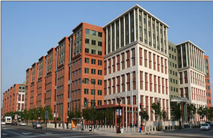
Figure 2: U. S. Department of Transportation’s (DOT) Headquarters, Washington D. C.