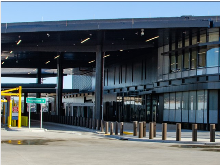
Figure 3. Department of Homeland Security’s (DHS) Calexico, CA, Land Port of Entry Project

the Calexico project in fiscal year 2026, for a total cost of $413 million 17 and received no funding. During the project, GSA increased the scope of the project by adding structured parking spaces and increasing the building area, which make direct cost comparisons difficult. However, the delays in receiving funding have contributed to the delay in completion of the project (see fig. 3).