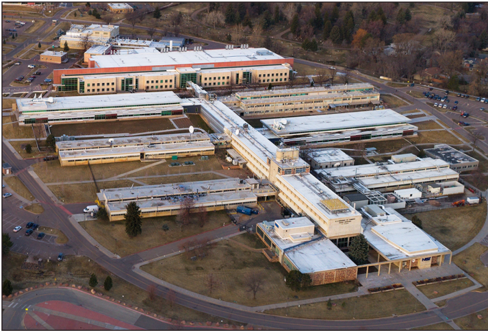
Figure 4. National Institute of Standards and Technology (NIST) Laboratory, Boulder Colorado.