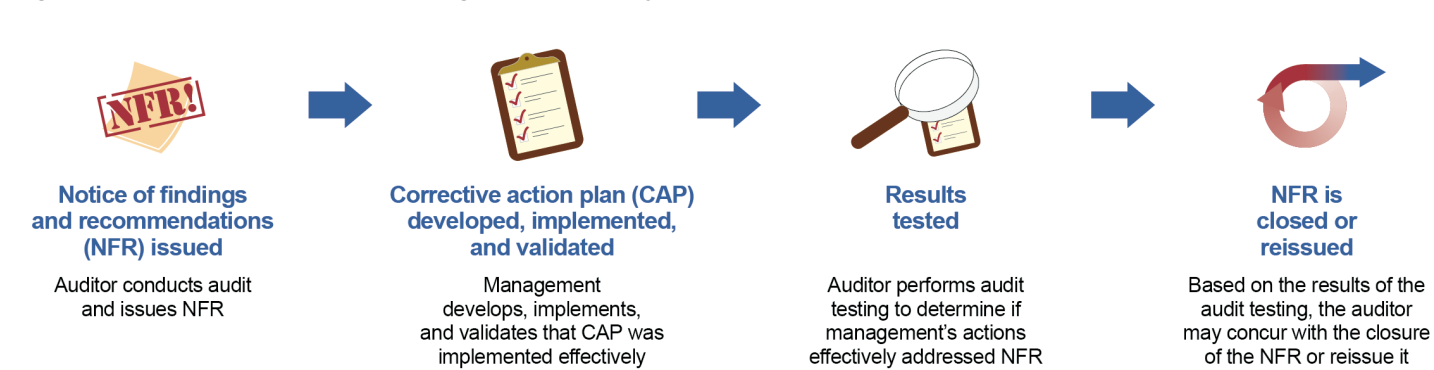
Figure 1: DOD's Process for Addressing NFRs Issued by Financial Statement Auditors

Source: GAO analysis of the Department of Defense (DOD) documentation. | GAO-21-157