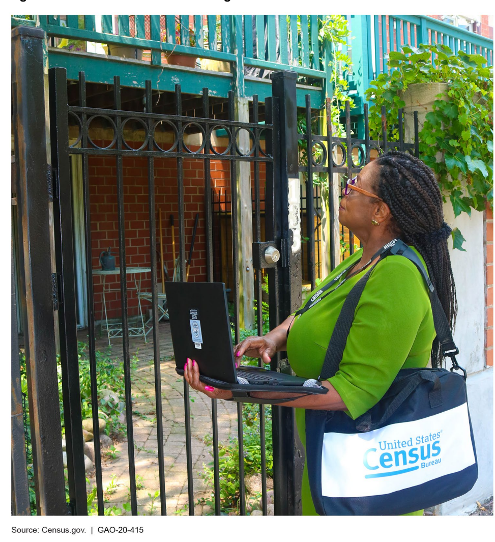
Figure 2: In-Field Address Canvassing Lister

The Bureau began the in-field address canvassing operation at seven of its 39 Area Census Offices on August 4, 2019, and then rolled out the operation to the remaining 32 offices on August 18, 2019. It conducted this phased approach to ensure all operations and systems worked together before commencing the operation nationwide. The total in-field address listing workload was more than 50 million addresses from the Bureau's address file. Bureau officials reported that listers were generally more productive than expected, thus allowing the Bureau to complete the operation as scheduled on October 11, 2019 (see fig. 3).