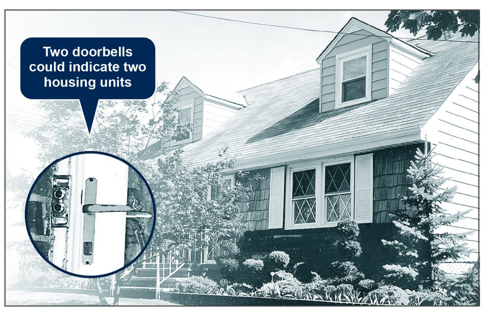
Figure 1: Determining an Accurate Address List Includes Identifying Whether a Dwelling Is Single or Multi-unit Housing

Our prior work has shown that developing an accurate address list is challenging—in part because people can reside in unconventional dwellings, such as converted garages, basements, and other forms of "hidden" housing.¹ For example, as shown in figure 1, what appears to be a single-family house could contain an apartment, as suggested by its two doorbells.