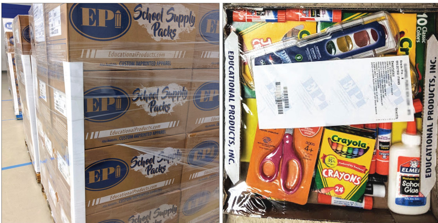
Figure 2: School Supplies Funded by the Johnson-O'Malley Program

supplies, according to BIE (see fig. 2). JOM programs, particularly for students who are not living near tribal land, may be the only way students can access tribal language and cultural programs.