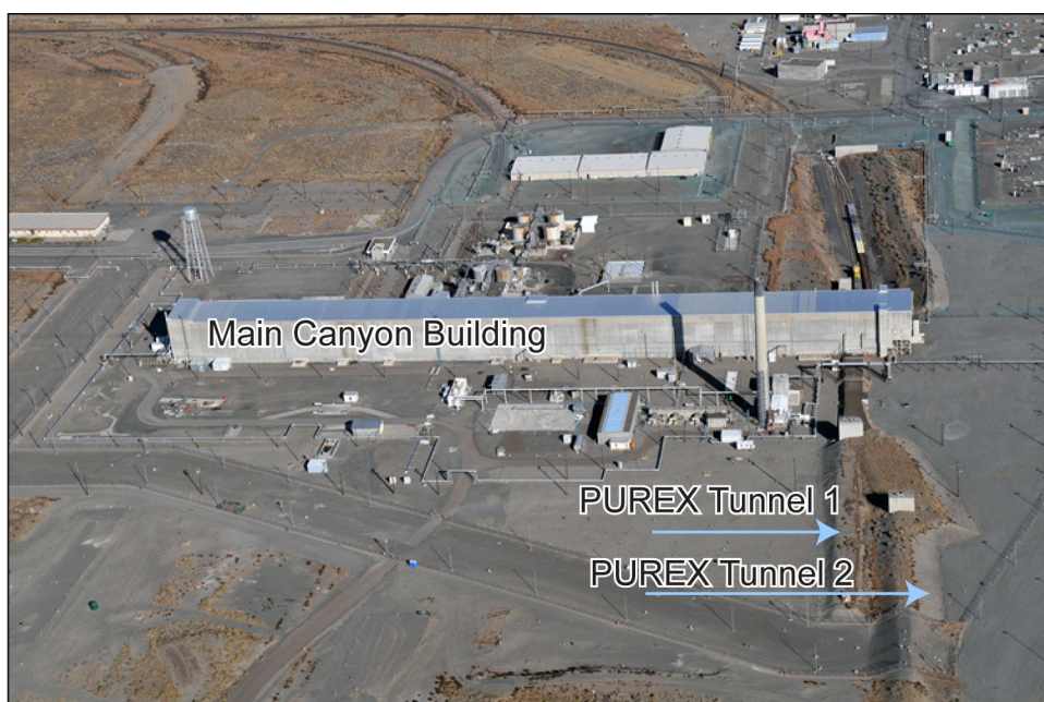
Figure 3: Main PUREX Plant and Auxiliary Facilities

Source: Department of Energy. | GAO-20-161