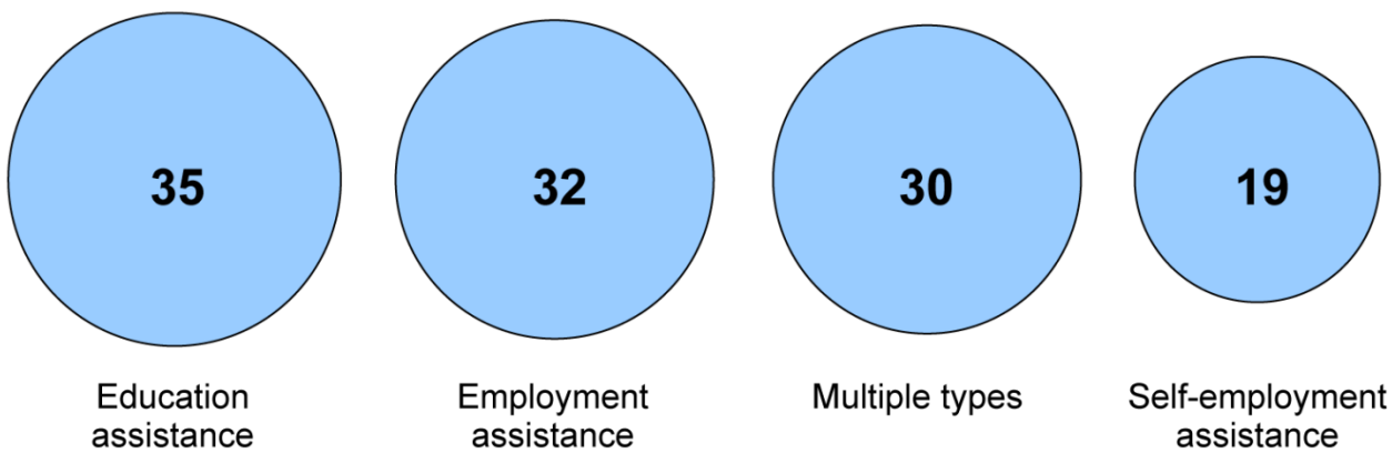
Figure 3: Number of Federal Programs Whose Primary Purpose Is to Provide Education, Employment, or Self-Employment Assistance to Servicemembers, Veterans, or Their Families, by Type of Service Provided

Source: GAO analysis of survey data. | GAO-19-97R