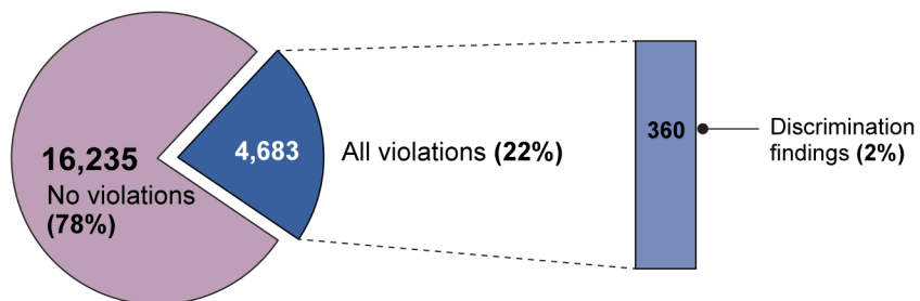
Figure 1: Findings of OFCCP's Federal Contractor Nondiscrimination Compliance Evaluations, from Fiscal Years 2010-2015

Source: Office of Federal Contract Compliance Program data. GAO-16-750. | GAO-19-719T