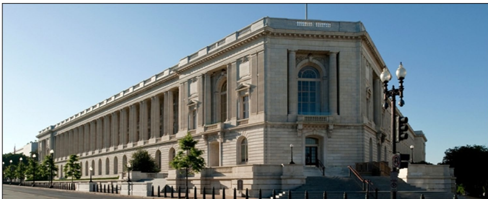
Figure 1: Cannon House Office Building, Washington, D. C.

Source: Architect of the Capitol. | GAO-19-712T