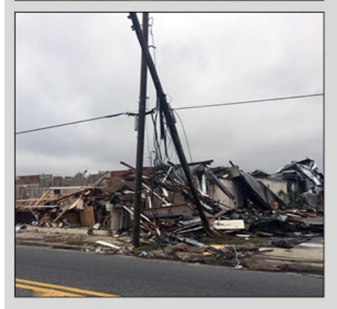
FEMA's Public Assistance program provides grants to repair public infrastructure such as water storage systems, roads, and power