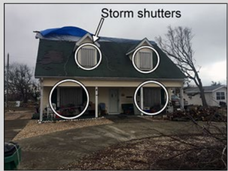
Some examples of hazard mitigation measures are house elevation, metal roofs, and storm shutters.