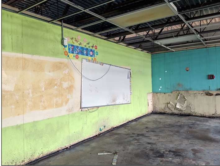
Classroom with molded floors and water damage on the walls at the Berwind Intermediate School in San Juan, Puerto Rico.

I GAO-19-594T