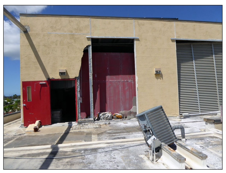
Figure 1: Hurricane Damage to a Hospital in the U.S. Virgin Islands and School in Puerto Rico