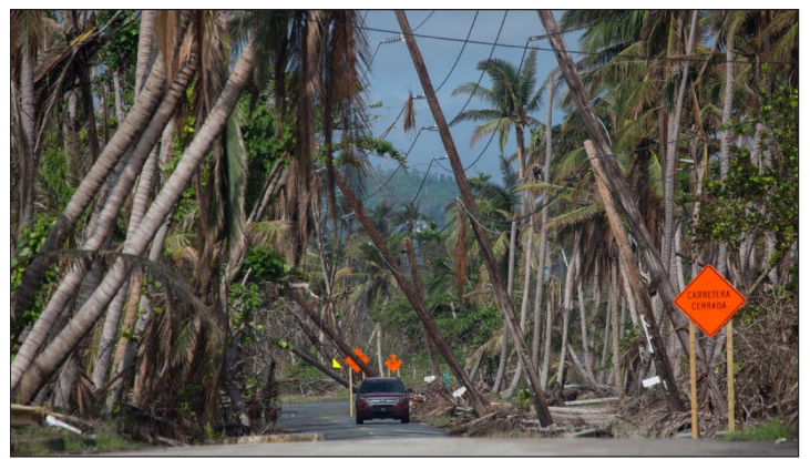
Figure 3: Damaged Power Lines and Satellite Dish in Puerto Rico After Hurricane Maria in November 2017