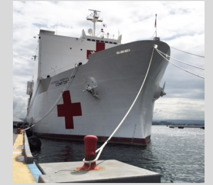
USNS Comfort in Puerto Rico in November

The USNS Comfort's primary mission is to provide an afloat, mobile, medical–surgical facility to the U.S. military that is flexible, capable, and uniquely adaptable to support expeditionary warfare. The ship's secondary mission is to provide full hospital services to support U.S. disaster relief and humanitarian operations worldwide.