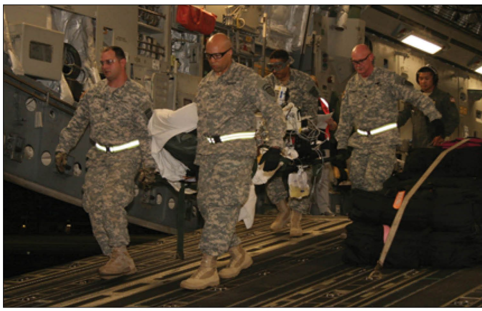
Figure 6: ASPR-led Evacuation of U.S. Virgin Islands Dialysis Patients to the Continental United States, September 2017

Source: Department of Health and Humans Services. | GAO-19-592