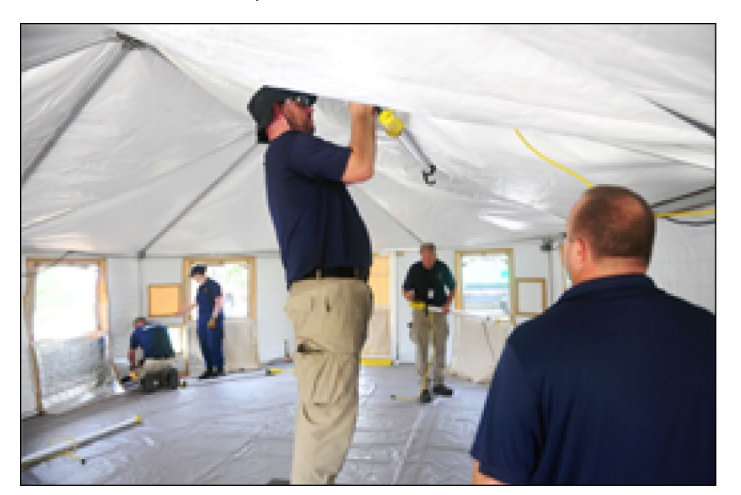
Figure 7: Department of Health and Human Services' Disaster Medical Assistance Team Setting Up a Temporary Medical Clinic in Puerto Rico, October 2017

figure 7 for photographs of Disaster Medical Assistance Teams setting up and providing services in Puerto Rico.