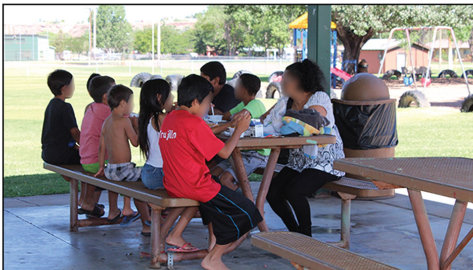
Figure 2: Summer Food Service Program Breakfast at a Park

year 2007 through 2016. FNS directs states to use the number of meals served, along with other data, to estimate the number of children participating in the SFSP. However, we found that participation estimates had been calculated inconsistently from state to state and year to year. Recognizing this issue, in 2017, FNS clarified its instructions for calculating participation estimates to help improve their consistency, noting that these estimates are critical for informing program implementation and strategic planning. However, we determined that the method FNS directed states to use would continue to provide unreliable estimates of participation, hindering the agency's ability to use them for these purposes. Standards for Internal Control in the Federal Government state that agencies should maintain quality data and process it into quality information that is shared with stakeholders to help achieve agency goals. 31