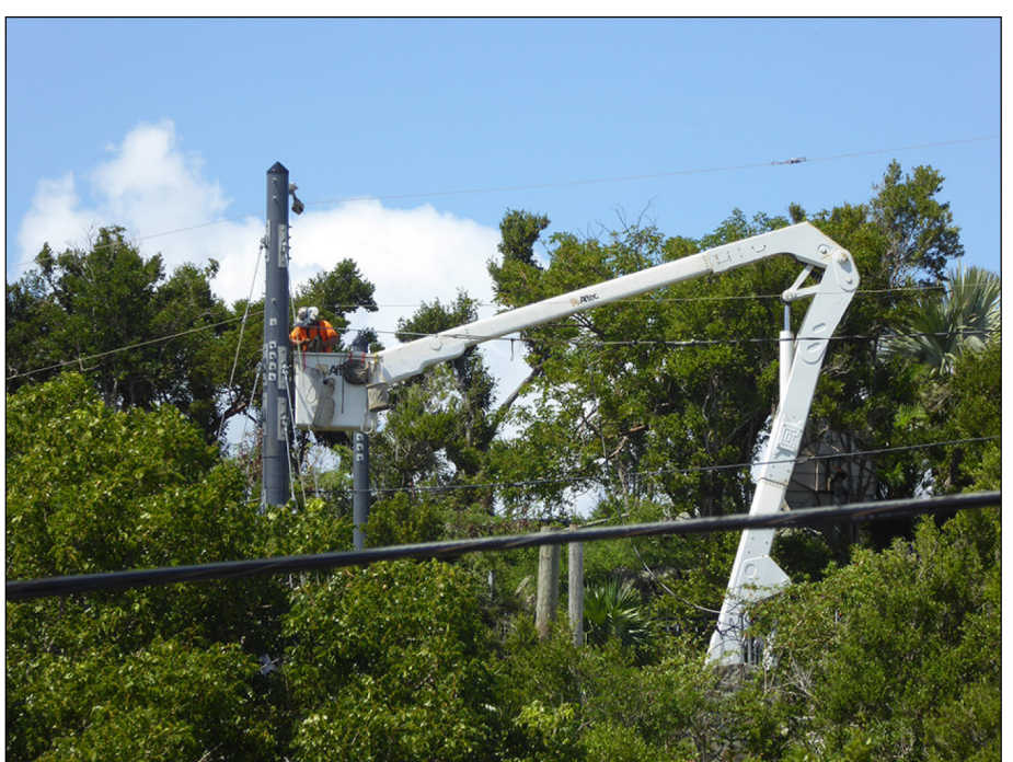
Figure 8: Composite Fiberglass Utility Poles in St. John, U.S. Virgin Islands

for 15 projects focused on repairing utilities, 7 of which included hazard mitigation measures totaling about $346.0 million.<sup>23</sup> For example, FEMA obligated $286.1 million and $50.2 million for permanent electrical distribution system repairs in St. Croix and St. John, respectively. This includes replacing damaged wooden utility poles with more resilient composite fiberglass poles that can withstand 200 mile per hour winds as well as power transmission lines and transformers (see fig. 8). Of the $502.2 million FEMA obligated for category F, the USVI had expended about $49.0 million (10 percent) as of October 1, 2018.