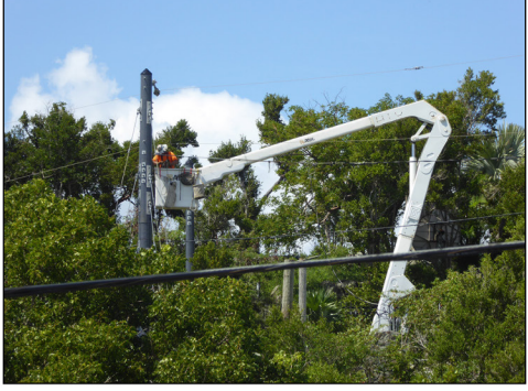
Wooden utility poles for electricity distribution are being replaced by composite fiberglass poles that can withstand 200 mile per hour winds.

Modular units are being constructed to serve as temporary school facilities. This large unit will be the cafeteria.