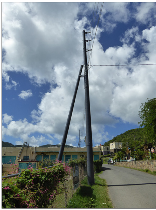
Wooden utility poles for electricity distribution are being replaced by composite fiberglass poles that can withstand 200 mile per hour winds. GAO-19-253

Category G: Parks, Recreational, and Other Facilities. FEMA obligated about $2.9 million for 26 projects focused on repairing