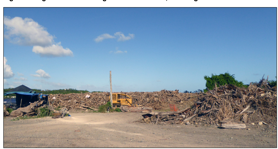
Figure 5: Organic Debris Storage Area in St. Croix, U.S. Virgin Islands

For example, FEMA obligated $45.0 million to the USVI Department of Public Works for territorywide debris removal efforts and $39.1 million to the USVI Water and Power Authority for these activities in St. Croix (see fig. 5). Of the $94.0 million FEMA obligated for debris removal, the USVI had expended about $54.6 million (58 percent) as of October 1, 2018.