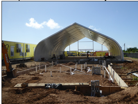
Modular units are being constructed to serve as temporary school facilities. This large unit will be the cafeteria.