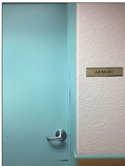
Figure 3: Examples of Recommended Physical Security Countermeasures Not Fully Implemented at Selected Facilities

Armory door has a lever handle lock, but should have a high-security dead bolt lock, access card reader, and intrusion detection device.