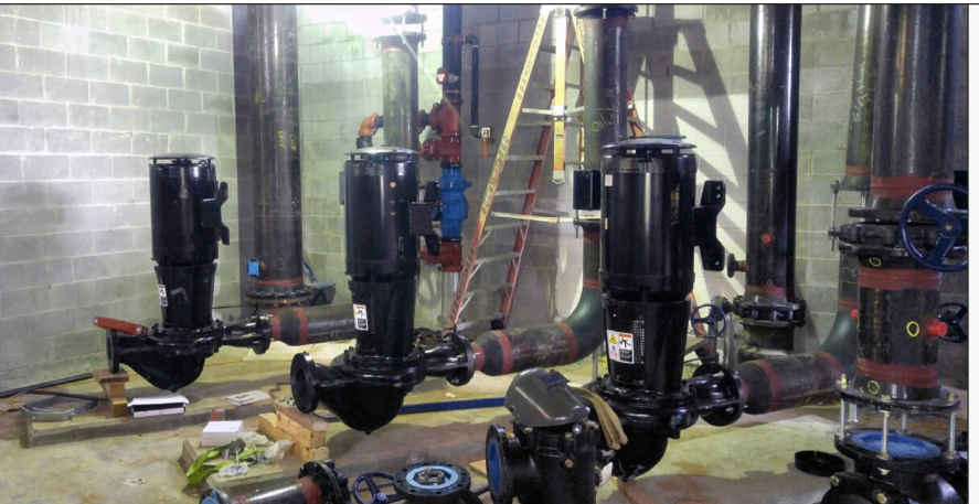
Figure 4: Carl Vinson VA Medical Center's Boiler Plant Addition

Carl Vinson VA Medical Center, Dublin, GA