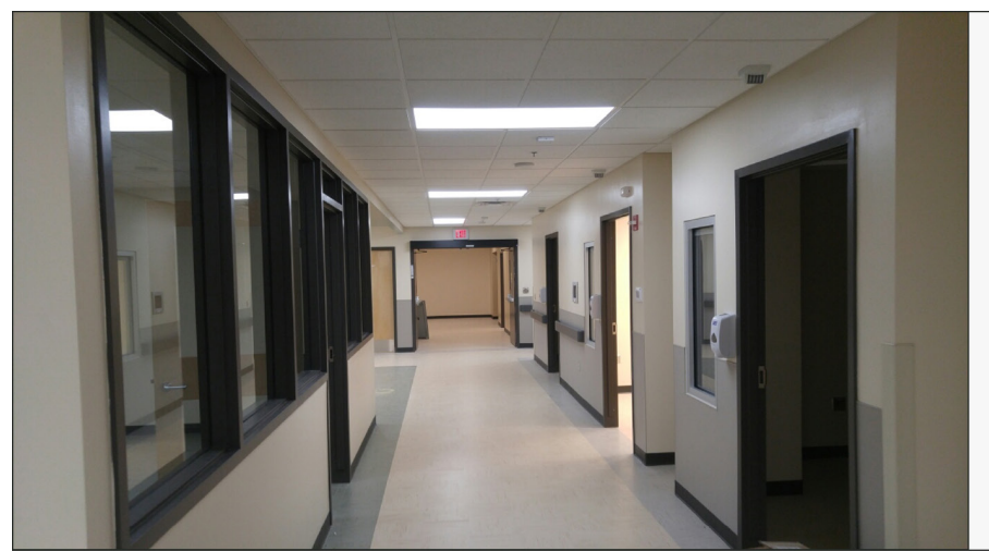
Figure 6: Iowa City Patient-Aligned-Care Team Addition

Iowa City VA Health Care System, Iowa City, IA