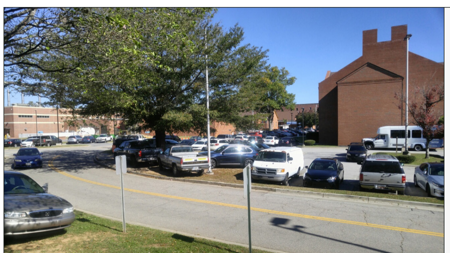
Figure 3: Wm. Jennings Bryan VA Medical Center's Current Parking Situation

GAO visited seven projects. These projects are described below based on VHA project information.