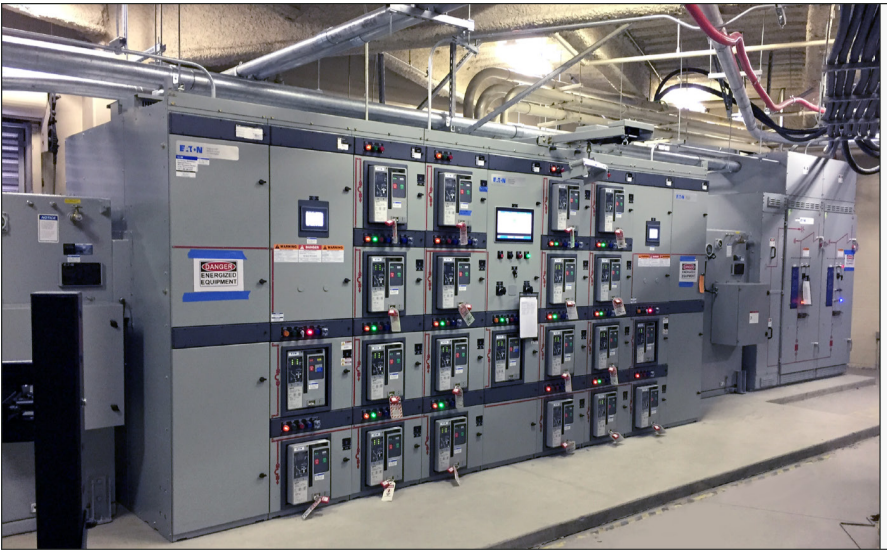
Figure 8: Seattle Electrical Upgrade

GAO-18-479