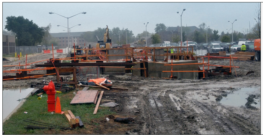
Figure 5: Hines Boiler Plant Project in Construction

Edward Hines Jr. VA Hospital, Hines, IL Project type: Non-recurring maintenance Project name: Boiler plant replacement