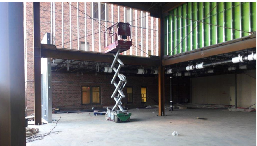
Figure 7: Kansas City Veterans' Service Center Addition