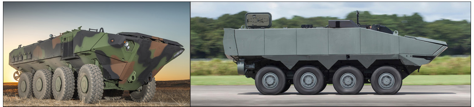
Figure 1: Amphibious Combat Vehicle (ACV) Prototype Vehicles

Source: (left to right) ACV 1.1 produced by BAE Systems Land & Armaments, L.P., © BAE Systems, Inc. and ACV 1.1 produced by Science Applications International Corporation, © SAIC (images). Images provided by Marine Corps Systems Command. | GAO-18-364