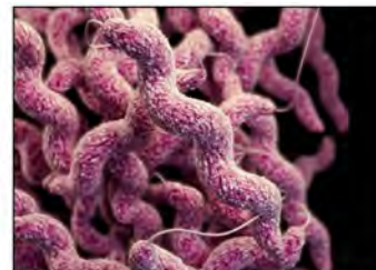
Illustrations of Salmonella (left) and Campylobacter (right).

GAO-18-272