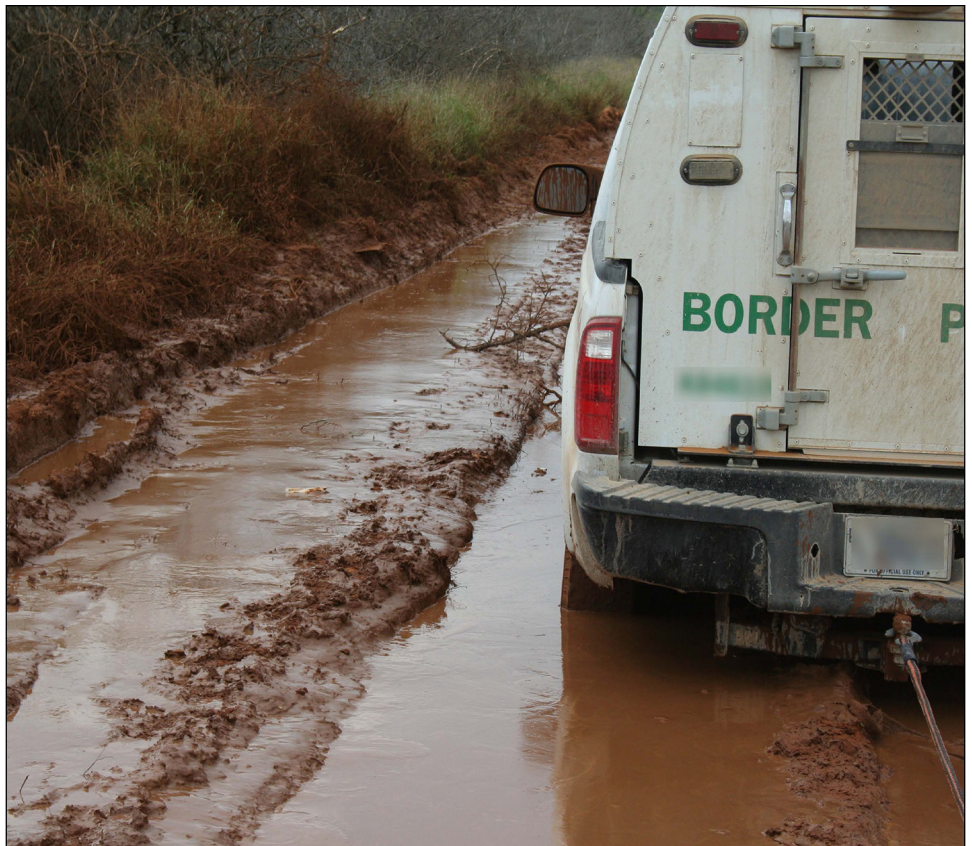
Figure 4: Poor Conditions on a County Road in Laredo Sector, Texas

also said that when agents do use roads like this one, it results in wear and tear on vehicles. Laredo sector officials reported that they had to contract for outside mechanics as a result of additional demands for vehicle repairs. Figure 4 documents the poor condition of the county road in Laredo sector.