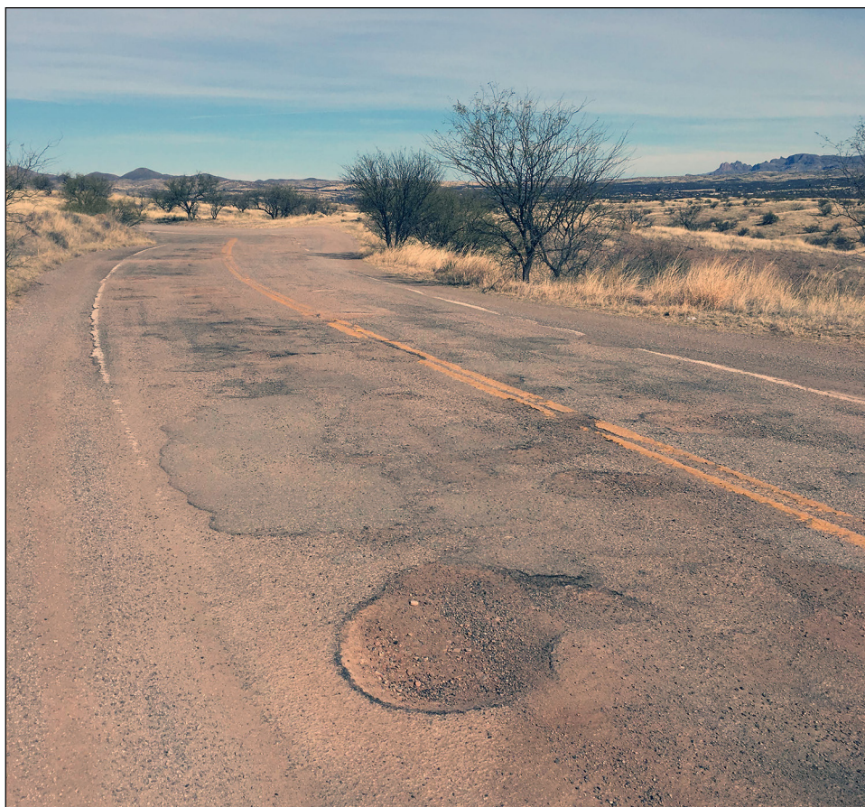
Figure 5: Poor Conditions on a County Road in Arizona

currently spend $23,000 more each year to maintain the 5-mile road than they would typically spend on a similar stretch of road as a result of the wear and tear they attribute to Border Patrol's use. Figure 5 shows potholes and deteriorating shoulders on the county road.