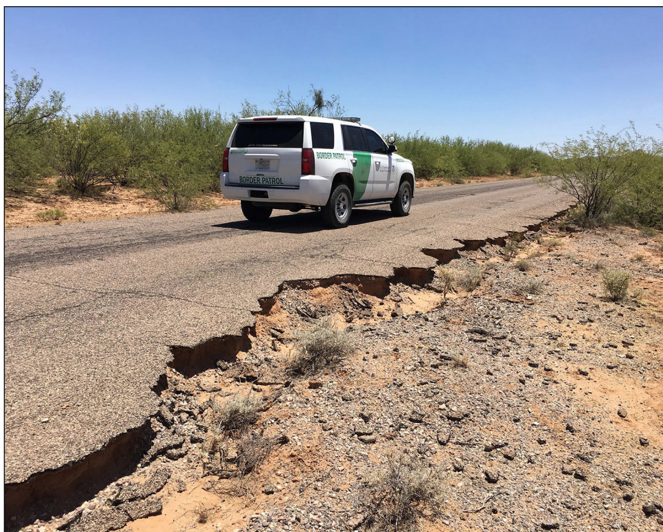
Figure 6: Eroded Conditions on a Tribal Road in Arizona

for road repairs annually to cover 29,000 miles of roads under its jurisdiction. Figure 6 shows the eroded condition of this tribal road. Officials from the Arizona county and tribe have requested Border Patrol's assistance in maintaining public roads. As of July 2017, however, Border Patrol had not provided such assistance. 39