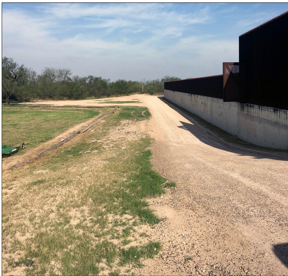
Figure 2: U.S. Customs and Border Protection Owned Operational Road along Border Fencing in Rio Grande Valley Sector

Figure 2 shows an example of a CBP owned operational road providing direct access to CBP fencing, and figure 3 shows an example of a road owned by U.S. Fish and Wildlife Service and used by Border Patrol for patrolling.