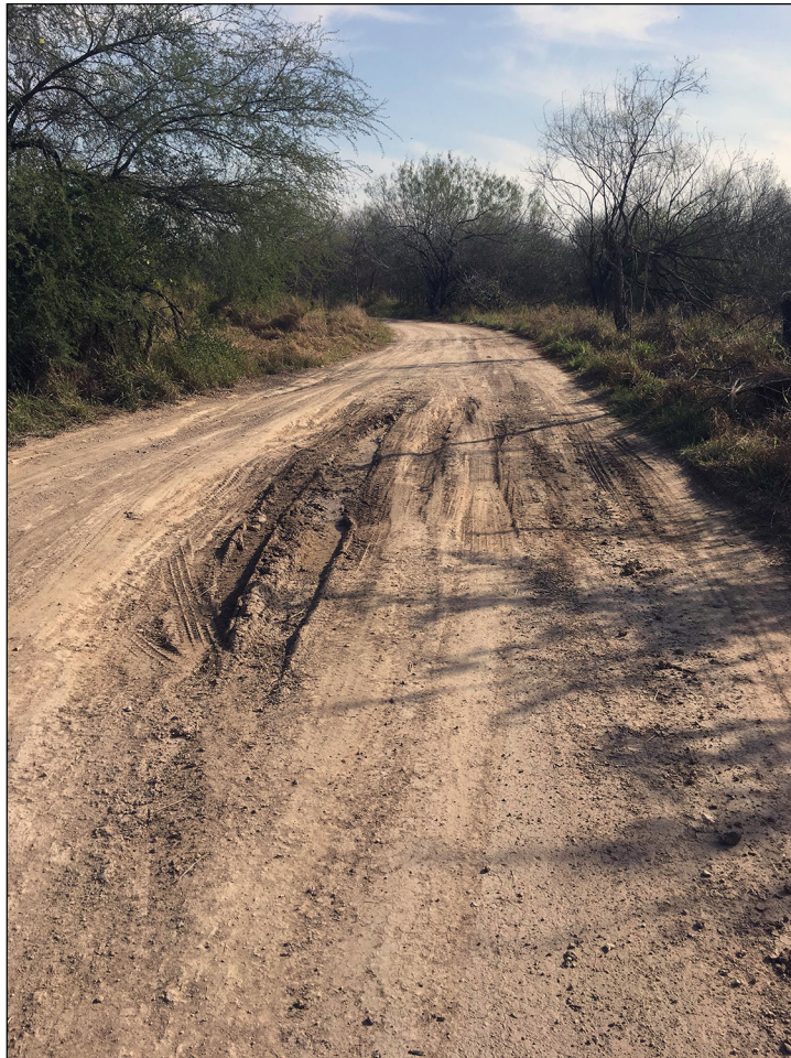
Figure 3: U.S. Fish and Wildlife Service Road That U.S. Customs and Border Protection Uses for Patrolling the Southwest Border