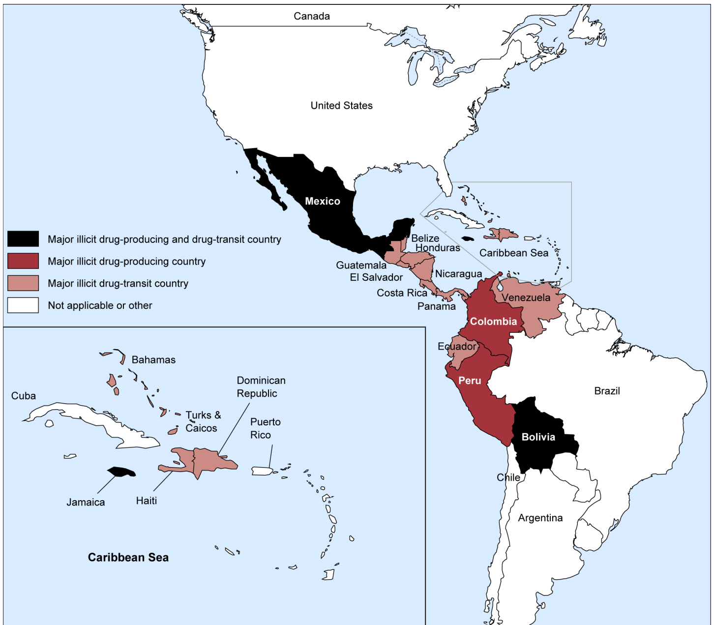
Figure 1: Map of Major Drug-Producing and Drug-Transit Countries in the Western Hemisphere

Source: Department of State's Bureau for International Narcotics and Law Enforcement Affairs, International Narcotics Control Strategy Report , Volume 1, Drug and Chemical Control, (March 2017). | GAO-18-10