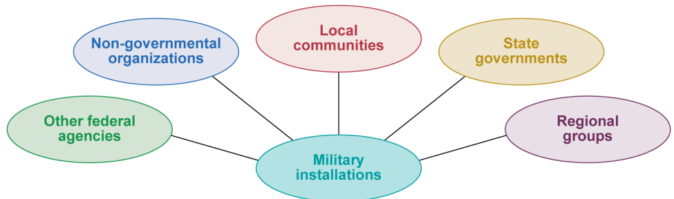
Figure 1: Key Participants in Collaborative Efforts to Identify and Mitigate Incompatible Land Use

Source: GAO analysis of Department of Defense information. | GAO-17-86