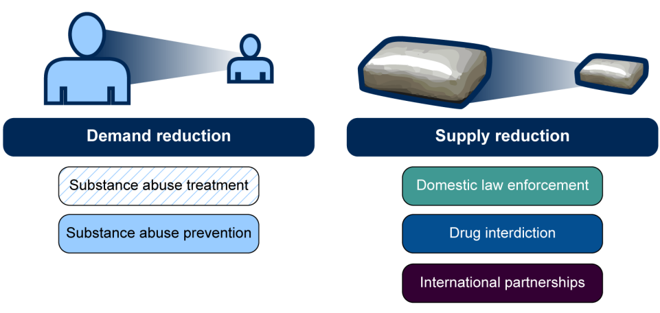
Figure 1: Federal Drug Control Program Priority Areas