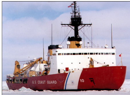
Figure 3: United States Coast Guard Icebreaker Polar Star

research center in Antarctica as both of its heavy polar icebreakers were inactive due to maintenance needs. The Coast Guard resumed this annual mission in 2014 following the reactivation of its other heavy icebreaker, the Polar Star , which is shown in figure 3.