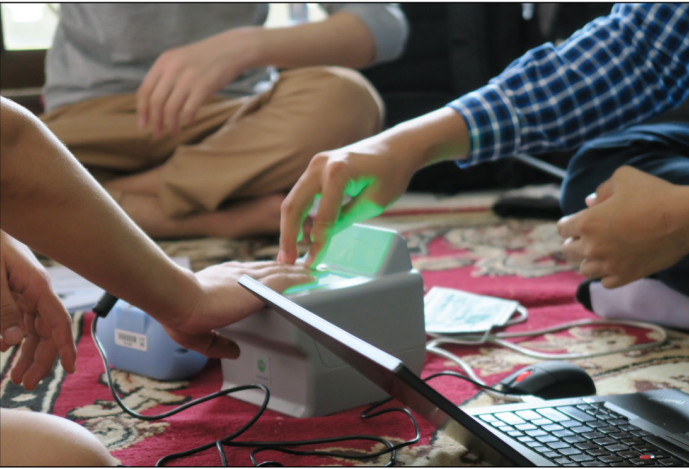
On the left, a Sudanese man provides iris scans during registration with UNHCR in Chad. On the right, an unaccompanied Afghan child provides fingerprint scans to UNHCR in a children's shelter in Indonesia.

GAO-17-737