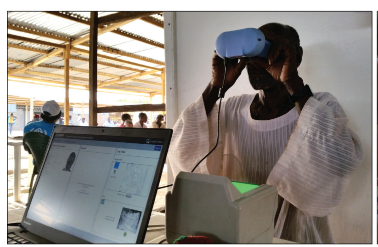
Figure 2: Technology that the United Nations High Commissioner for Refugees (UNHCR) Uses to Register and Verify Refugee Identities