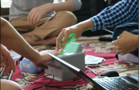
On the left, a Sudanese man provides iris scans during registration with UNHCR in Chad. On the right, an unaccompanied Afghan child provides fingerprint scans to UNHCR in a children's shelter in Indonesia. | GAO-17-737

To reduce the risk of fraud committed by staff at the nine Resettlement Support Centers (RSC) worldwide, State and RSCs have instituted several antifraud activities, many of which correspond with leading antifraud practices, but key gaps remain. Overseen by State, the organizations that operate RSCs hire staff to process and prescreen applicants who have been referred for resettlement consideration. According to State and RSC officials, RSCs have experienced staff fraud. Officials said that instances of staff fraud are uncommon, but they illustrate risks to the integrity of RSC operations. To manage these risks, State and RSCs have established a number of activities consistent with leading antifraud practices. For example, officials from all nine RSCs stated that they assign staff fraud risk management responsibilities to designated individuals. State has also worked with RSCs to develop and implement controls to ensure program integrity. However, RSCs face challenges implementing some of these controls. Additionally, State has not required RSCs to conduct regular staff fraud risk assessments tailored to each RSC or examined the suitability of related control activities. Without taking additional steps to address these issues. State and RSCs may face challenges in identifying new staff fraud risks or gaps in the program's internal control system as well as designing and implementing new control activities to mitigate them.