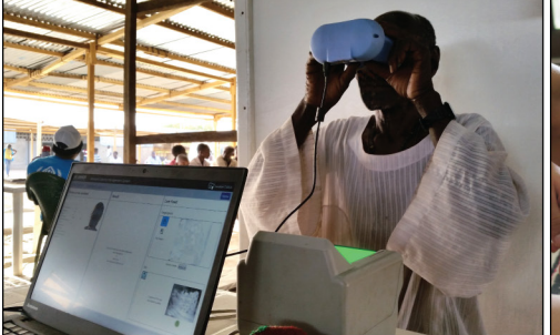
Figure: Technology that the United Nations High Commissioner for Refugees (UNHCR) Uses to Register and Verify Refugees

The Department of State (State) and the United Nations High Commissioner for Refugees (UNHCR) have worked together on several measures designed to ensure integrity in the resettlement referral process. State and UNHCR have established a Framework for Cooperation to guide their partnership, emphasizing measures such as effective oversight structures, close coordination, and risk management. Working with State, UNHCR has implemented standard operating procedures and other guidance that, according to UNHCR officials, provide baseline requirements throughout the referral process. UNHCR also uses databases to help verify the identities of and manage information about refugees. These systems store biographic information such as names, personal histories, and the types of persecution refugees experienced in their home countries. They also maintain biometric information, such as iris scans and fingerprints.