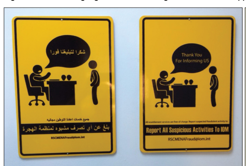
Figure 3: Antifraud Signage in Selected Refugee Resettlement Support Centers (RSC)

have required RSCs to establish physical drop boxes or e-mail addresses to allow applicants to report instances of suspected staff fraud, as well as whistleblower policies for other staff to inform RSC management of suspected staff fraud. State has also required RSCs to include signage that indicates that the admissions process is free and instructions on how to report fraud. See figure 3 for examples of such RSC antifraud signage. Each RSC that we visited displayed similar signage in interview rooms, hallways, or applicant waiting areas.