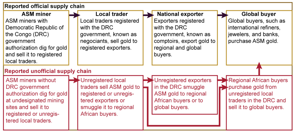
Illustration of Reported Official and Unofficial Supply Chains for Artisanal and Small-Scale Mined (ASM) Gold in the Democratic Republic of the Congo

Sources: GAO analysis of reports by U.S. agencies, the United Nations (UN), and nongovernmental and international organizations and of interviews with government and nongovernment stakeholders. | GAO-17-733