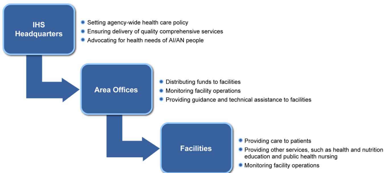
Figure 2: Responsibilities of Indian Health Service Headquarters, Area Offices, and Federally Operated Facilities Related to Health Care for American Indians and Alaska Natives