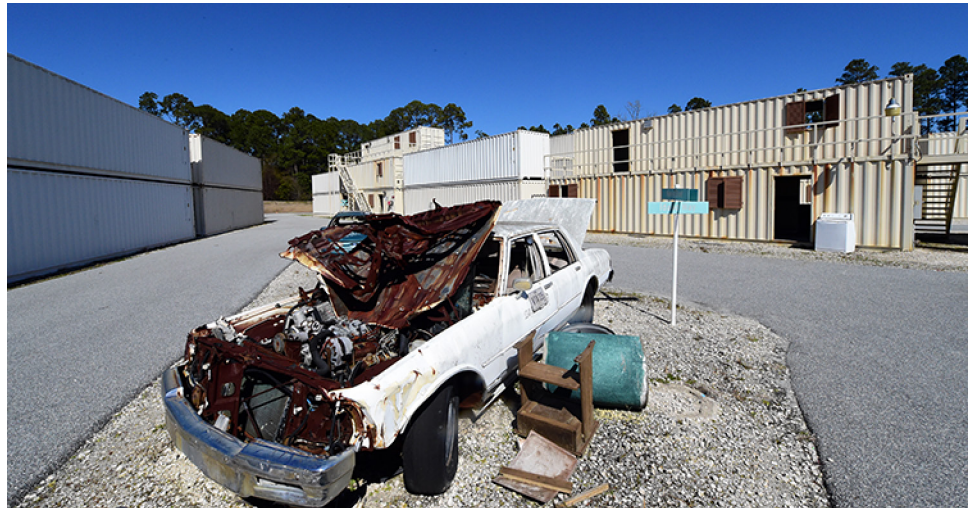
Figure 5: Federal Law Enforcement Training Centers Counter-Terror Operations Training Facility

GAO-15-808R