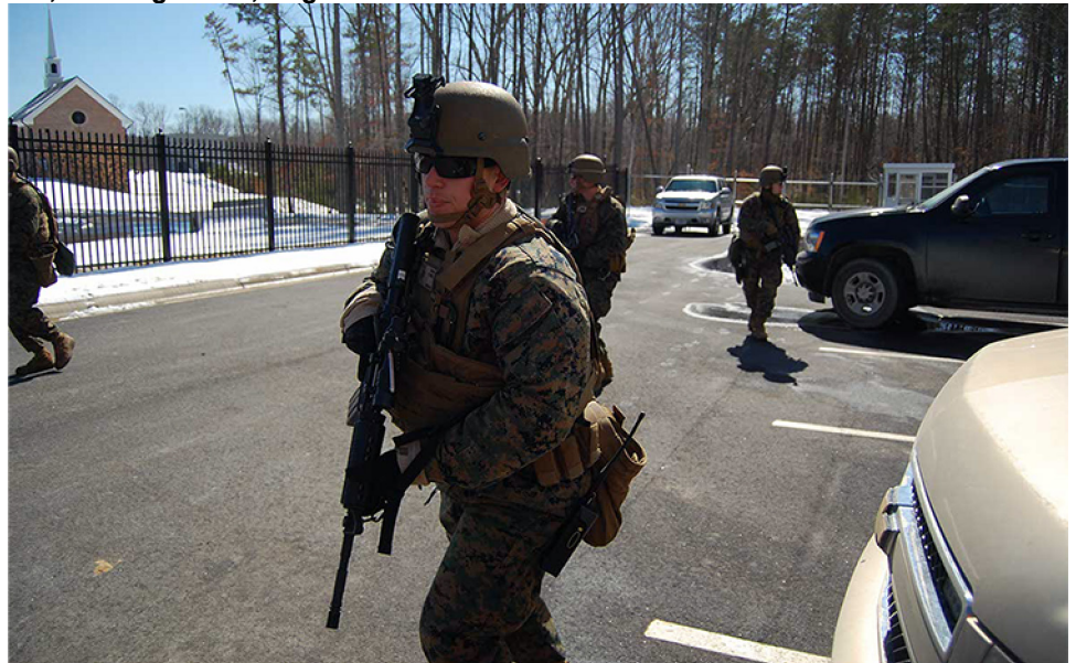
Figure 4: Bureau of Diplomatic Security Capstone Exercise with Marines at Fort A.P. Hill, Bowling Green, Virginia

GAO-15-808R