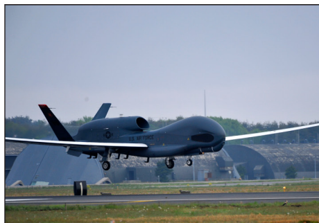
Air Force Global Hawk