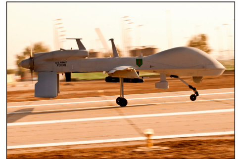
Army Gray Eagle