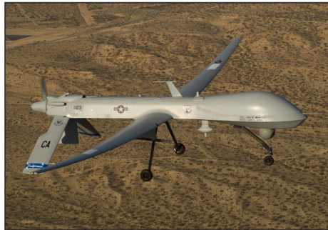
Air Force Predator