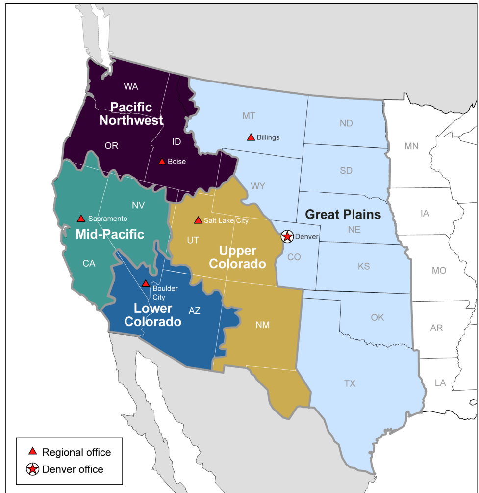
Figure 1: Bureau of Reclamation Regional Boundaries

Sources: Bureau of Reclamation; Map Resources (map). | GAO-14-764