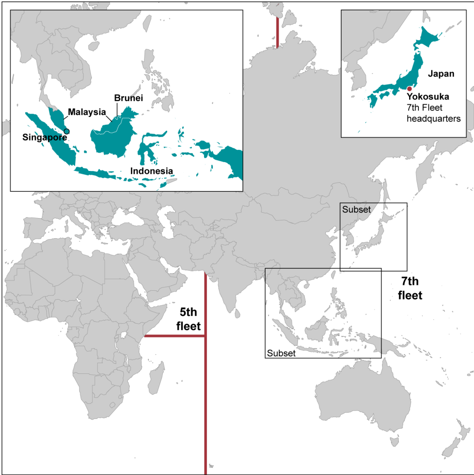
Figure 2: Areas of Responsibility of the Navy's 5th and 7th Fleets and Approximate Location of Singapore Deployment of Littoral Combat Ship USS Freedom

Source: GAO analysis of Navy documentation (data); MapResources (map). | GAO-14-749