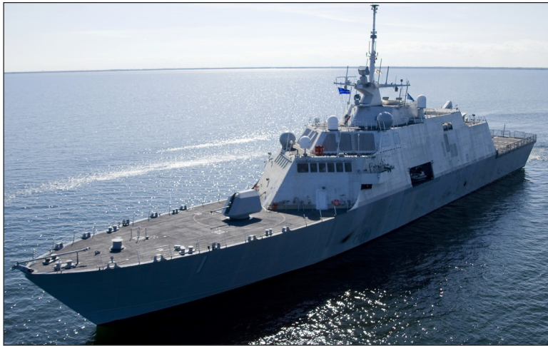
Figure 1: Two Variants of Littoral Combat Ships

GAO-14-749