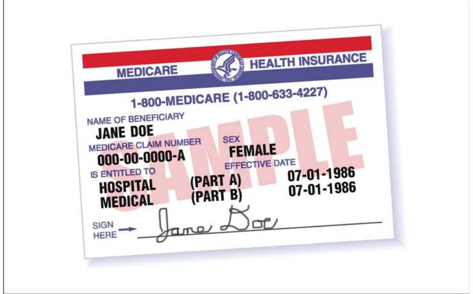
Figure 1: Medicare Card