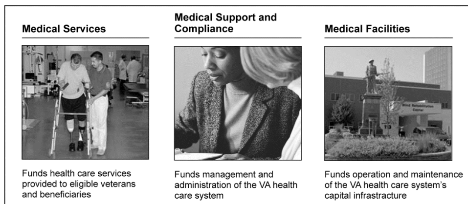
Figure 1: VA Medical Care Appropriations Accounts